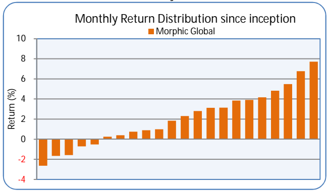
Chart 4: Correlation to ASX200's best and worst months